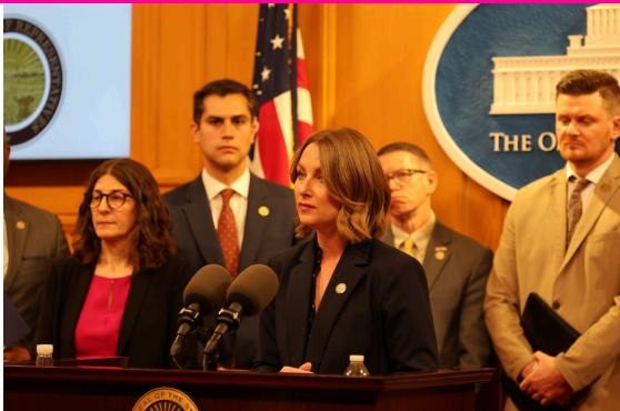
Rep. Lett speaking at the affordability press conference