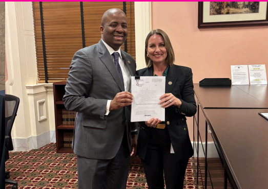
Rep. Robinson and Rep. Lett introducing HB 800: Preschool for All