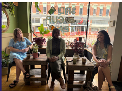
Rep. Cockley at a Leading Ladies of the Legislature town hall.