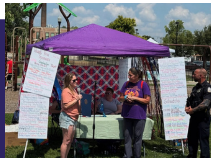
Rep. Cockley attending the 20th annual Hilltop Day Out and delivering a commendation.