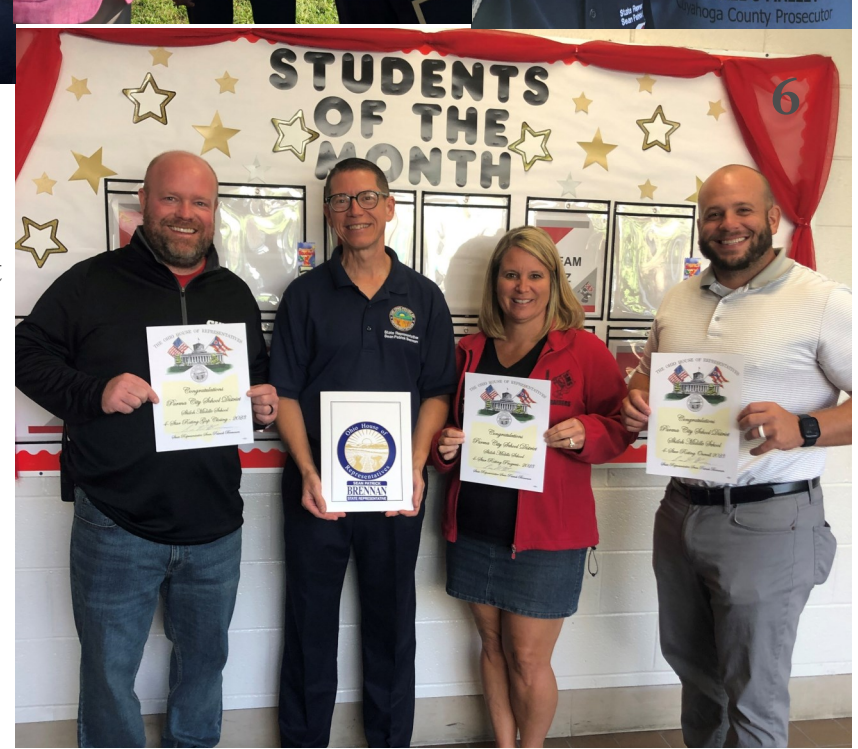
6: Thirty years ago I was a substitute teacher at Shiloh Middle School—now I get to stop by and say congratulations for great performance on the state report card!