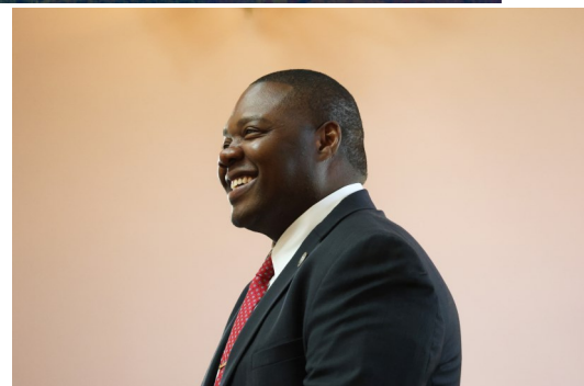
On the House floor during Session