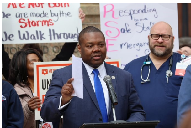
Addressing nurses during a safe staffing rally