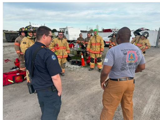
Vehicle extrication class with the Lake Township Fire Department