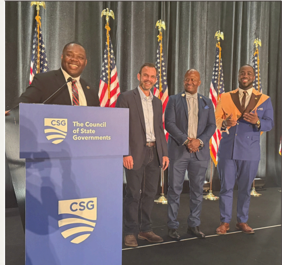
Council of State Governments