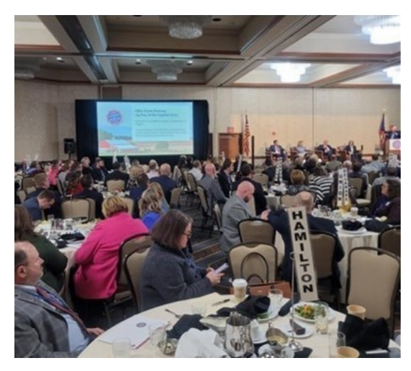
Agriculture Day 2025 at the Ohio Statehouse