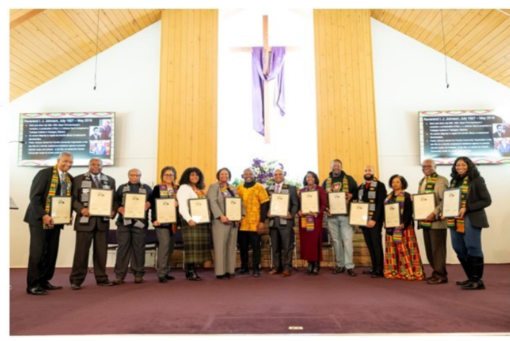
Recognizing Community Difference Makers

As many of you are aware – I have a longstoried history serving and helping homeowners and businesses understand and address their property tax burdens. I have discussed and sat with families all across Northwest Ohio helping them access property tax credits and discounts. If you are experiencing any frustration or have questions regarding your property taxes, please call your County Auditor. There is a process where you can contest the Auditor's valuation of your property. This process in known as going through the Board of Revisions. It is simple and will provide you with an opportunity to show why you believe that your property's assessment should be adjusted. The staff at your county Auditor's office can help walk you through the process. If you have any issues or questions please contact my office after working with the Auditor's office.