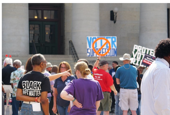
ABOVE—Ohioans from all parts of Ohio rallied on the grounds of the Statehouse in support of protecting the freedom to Vote.

Voting Rights In Ohio are Under Attack, and protecting the Right to Vote was a focus of mine and my House Democrat colleagues during June. During the first week of June, I joined several of my colleagues to host a town hall in Toledo as part of the “Freedom to Vote Town-hall Tour.” During the event, nearly thirty community activists and local leaders stood up and testified about the importance of protecting voting rights and ensuring every Ohioan has unburdened and unobstructed access to the ballot box. I was proud to have joined my colleagues and the community in attendance that night. Later in June, hundreds of Ohioans from across the state came together and rallied to protect the freedom to vote outside the Statehouse in Downtown Columbus. We should work to pass legislation to protect the right to vote, expand freedoms, and not suppress that freedom. Once again, witnessing the rally firsthand was an incredible experience. As the House returns to session in the Fall, rest assured that I am committed to continuing to stand up against anti-voter legislation such as House Bill 294. I am committed to pursuing legislation to expand freedom to vote in Ohio and ensure every Ohioan has the right to vote and is able to cast a ballot each and every election.