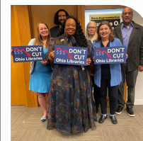
Cuyahoga Library Council