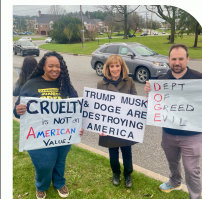
Hands Off Rally