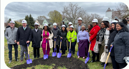
Birthing Beautiful Community Groundbreaking