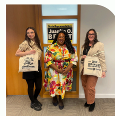
Ohio Organizing Collaborative