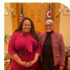
Mayor Sandra Morgan (East Cleveland)