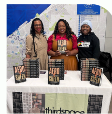
Cleveland Public Library