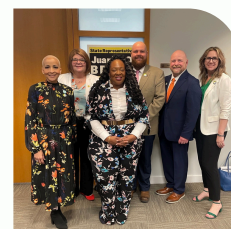
Mental Health Addiction & Advocacy Coalition