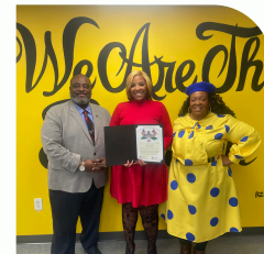
Village of Healing