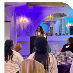
Pregnant with Possibilities Resource Center