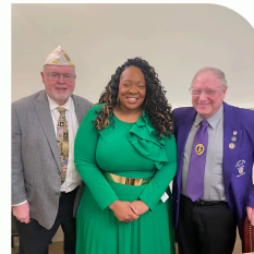
Military Order of the Purple Heart & Disabled American Veterans